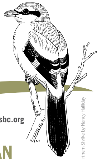
Northern Shrike