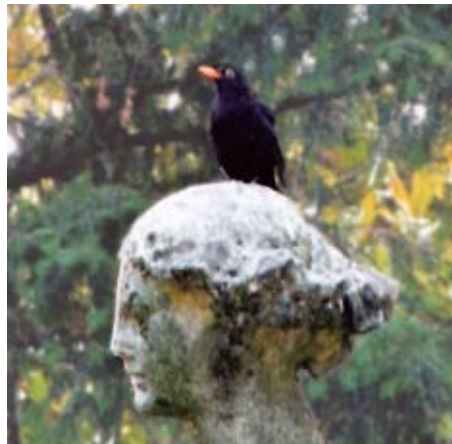
“I Speak Bird!”

I recently visited Isonzo Delta, a nature preserve in Italy, that is a birding hotspot. I was there with family, none of whom bird. But I was fortunate enough to encounter two Italian birders in the observation blind. The gentleman knew all the English names and generously pointed out lifers for me in the large wetland. The lady birder tried to help as well. “My English is not so good,” she said. “Ma, tutto parliamo uccelli. (But we all speak bird),” I replied. They laughed. After the gentleman left, the lady was able to communicate the location of a Spoonbill, that I had overlooked between all the Great and Little Egrets.