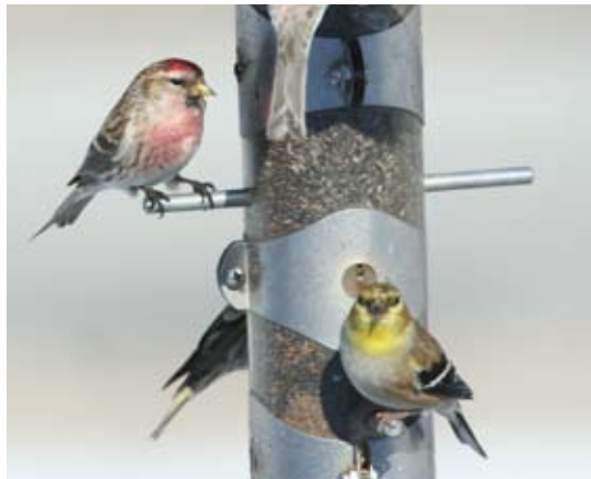
Winter Finches - photo by Tim Wallace.

"The minimum hours required for a count in temperate latitudes is eight continuous hours, but