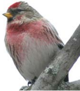
Common Redpoll