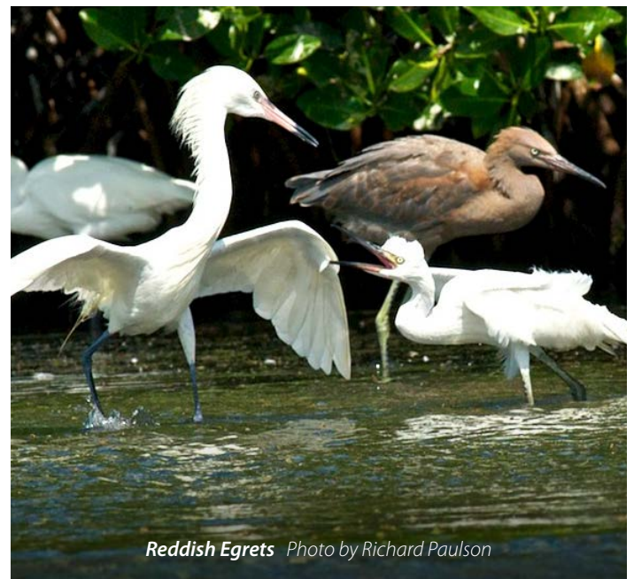
Reddish Egrets

The Illinois Extension has an excellent small leaflet that describes our locally resident species and some of the threats to their existence ( See: bit.ly/KMb0gt ). Unfortunately, this was written before White Nose Syndrome appeared. One of the best sites for learning about the beauty, variety and importance of bats is Bat Conservation International, a group I belong to (See: http://batcon.org/ ).