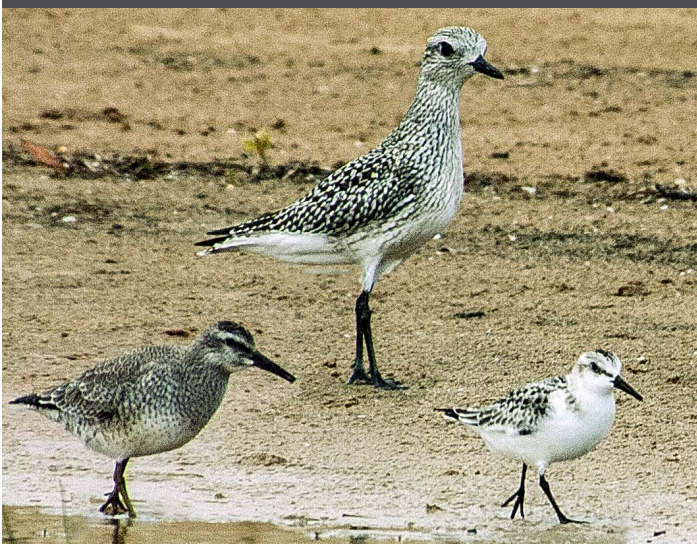
BELOW: Red Knot, Black-bellied Plover, Sanderling