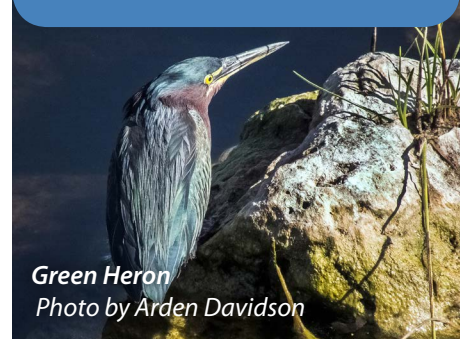
Green Heron

The ENSBC membership starts April 1, 2015. Renewals can be made on line at http://www.ensbc.org/join.html or by emailing info@ensbc.org . Membership renewals are also sent by mail or email so keep a look out for yours!