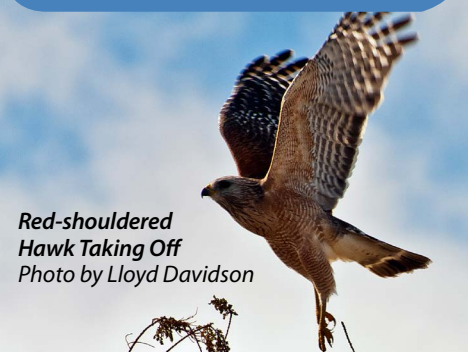
Red-shouldered Hawk Taking Off