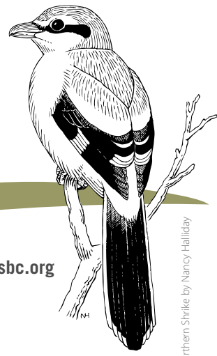
Northern Shrike