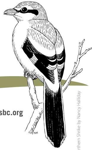
Northern Shrike